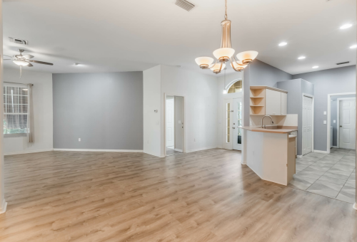
2 Beds | 2 Baths | 1537 Sqft 285000