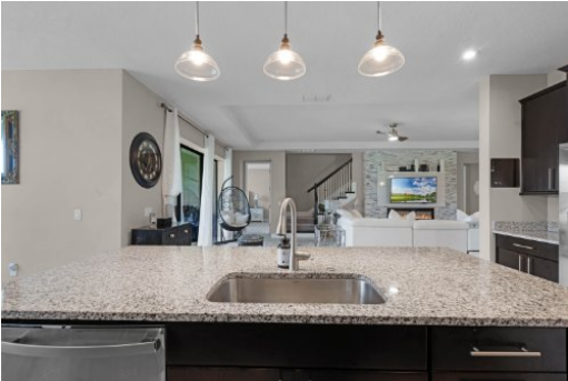
Information provided is for consumer's personal, non-commercial use and may not be used for any purpose other than to identify prospective properties consumers may be interested in