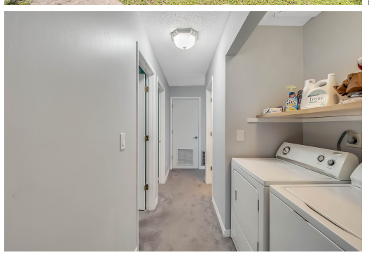
3 Beds | 2.5 Baths | 1408 Sqft