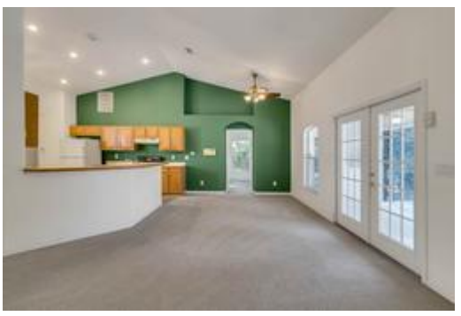
3 Beds | 2.0 Baths | 1,714 Sqft

Come see this 3 bed, 2.0 bath in Clermont, FL 34711. This location offers 1,714 square feet of air conditioned living space and was built in 1999.